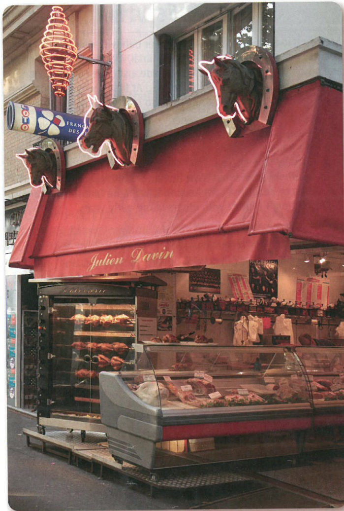
▲ Horsemeat butchers, France

whereas in others only one is allowed (monogamy). Similarly, some cultures have taboos on specific foods, or rules about what foods may be eaten together.