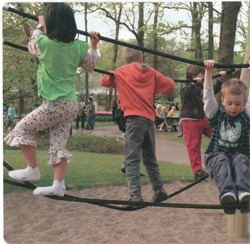
▲ Much of our learning occurs in our early years.

Sociologists therefore argue that biology and instincts cannot explain our behaviour, because most of it is learned not inborn, and because it is not fixed for all members of our species, but varies between societies. As an alternative way of explaining human behaviour, therefore, sociologists use the two related ideas of culture and socialisation.